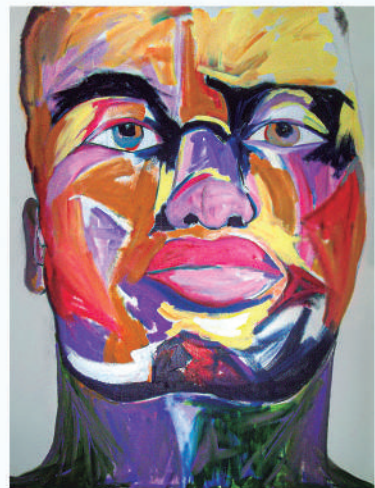
I'M STILL HERE 2010, acrylic on canvas, 150 x 130 cm