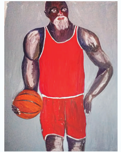
ETERNAL PROSPECT 2021, oil on canvas, 180 x 137 cm

Simple you can't spend your whole life doing plans for when you have the chance to do something, life changes in the blink of an eye. The time is now, look for your dream, fight for it and believe it, don't leave it for when you have time because when you have time you may not be able to, the potential will not accompany you for the rest of your life, declare yourself in rebellion against what you cannot do it, today look for the now and you will stop being a promise.