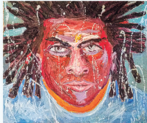
WE ARE BEAUTIFUL 2021, oil on canvas, 55 x 64 cm