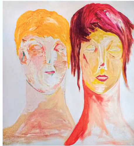
ROCKEFELLER'S BOYS 2012, acrylic on canvas, 140 x 130 cm

I usually have an idea of what I'm going to do although I prefer to work from the titles because that way the work acquires a more theatrical edge and gives me the way to underline what I want to emphasize in my message, a plastic work must be more than an object to decorate even I think it should be like a good book that every time you read it you reflect on it. Yes, in my work the title is maybe where I want it to be observed the painting is like a forced foot and that way where the imagination begins to fly.