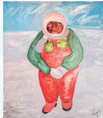
THE SNOW ALSO GETS DIRTY 2018, oil on canvas, 150 x 130 cm

4. I sometimes see sadness and certain loneliness in your work for example in the painting "The snow also gets dirty", is that child you? or can you talk to me a little in particular of the motivation of that work or another that you lean on sadness?