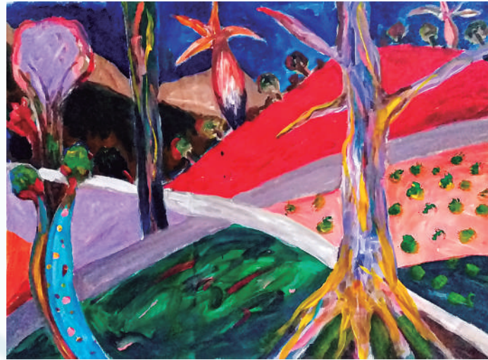
FOUR WAYS 2022, acrylic, 75 x 105 cm

work is to that involuntary act called sketch is freer, painting is build a new world and when I go into I am his architect although I try to make him look like the man that I am, I have things that affect me or that make me happy, a painting does not live in a world uninhabited, lives in a world with many things for change, modern or contemporary art lives in a world with too many rules where they cohabit with limited freedoms is perhaps why we do not we agree on your classification.