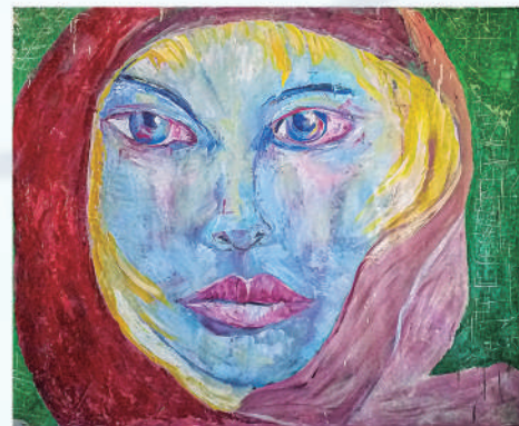
LITTLE RED HOOD HAS GROWN UP 2021, oil on canvas, 120 x 150 cm