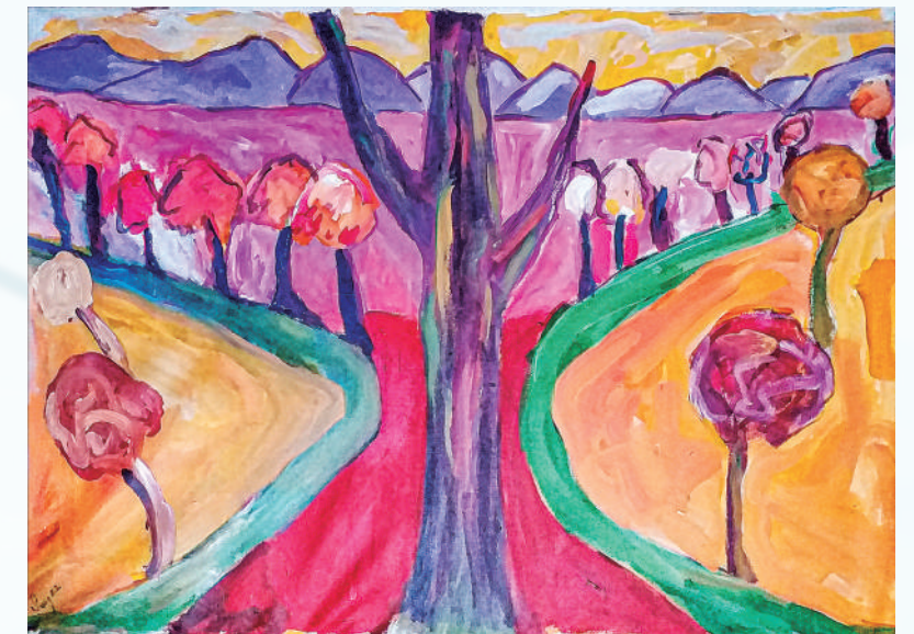
A SINGLE STICK DOES NOT MAKE A MOUNT 2022, acrylic, 75 x 105 cm

Sometimes I am a stick and sometimes I am a mount, in some moments I need the loneliness of a long encouragement runner because although for some loneliness is bad counselor I am never alone, my works accompany and they are my mounts where my alive, my dead, my friends, my enemies, my dissatisfactions, illusions and disappointments live, without establishing an enchanted mount and so real where total happiness does not yet exist but we must not tire of searching.